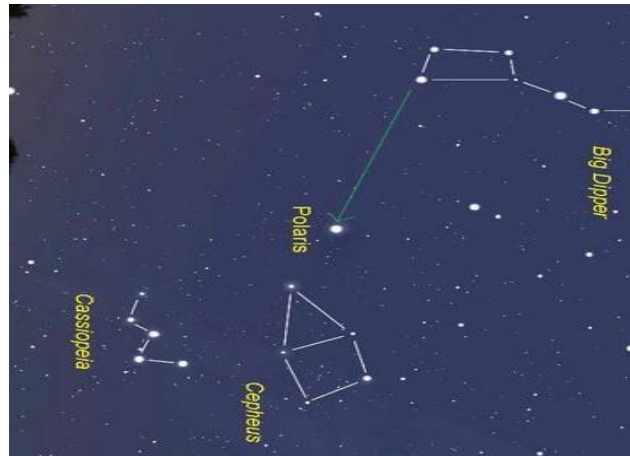
Cassiopeia, Cepheus and The Plough or Big Dipper.

The Moon This month's moon is known as the Worm Moon, due to the thawing of the ground, which allows the worms to start breaking up the top soil. Full moon occurs on the 14 th of the month, and, if you are around at 4 AM look out for a partial eclipse that occurs while it is setting. Between the 4 th and 10 th of March the moon will be making its way up from the western horizon past The Pleiades star cluster, Jupiter, Mars and the constellation of Gemini.