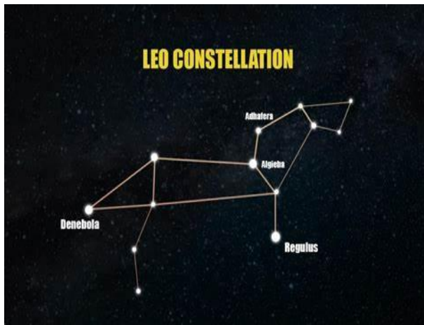
Leo (The Lion)

Constellations The winter constellations are now well out to the west which has allowed Gemini and Leo to dominate the southern sky. Leo (The Lion) can be found by looking out to the SE for the reversed question mark, that forms the head and chest of the lion. Looking north will find Cassiopeia (mother of Andromeda), recognized by its 'W' shape, albeit on end this month. Just to the right of Cassiopeia, you will find Cepheus (The King, and husband of Cassiopeia and father of Andromeda. Its 5 main stars form a shape that resembles the gable end of a house or even a church steeple. A look through binoculars at the base of the constellation, will reveal a large number of stars, as the Milky Way passes through the constellation at this point. One particular star, Cephei, will stand out because of its deep red colour, which gives it its other name, The Garnet Star. This is one of the largest stars ever discovered, being some 1400 times the diameter of our sun and rightly giving it the classification of a red supergiant. The solar system out as far as Jupiter would easily fit inside it. Ursa Major (The Great Bear) is practically overhead this month. Look out for the saucepan (albeit upside down) shaped set of 7 stars. These are known as The Plough or Big Dipper.