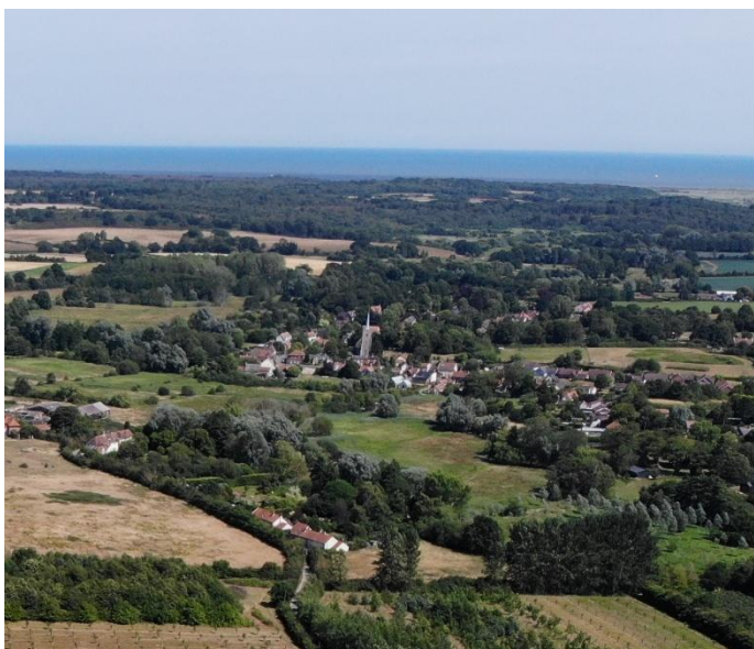
Middleton from the air

November and January meeting times will also continue to be held in the afternoons.