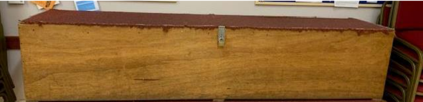
Middleton carpet bowls club long box surplus to requirements if anyone would like it perhaps for shed or garage storage? It’s about 6/7 feet long . Last chance or it will need to be broken up. Contact Barbara to view.