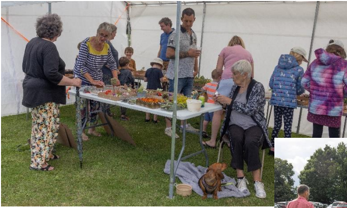
The WI were there with their cakes and produce.