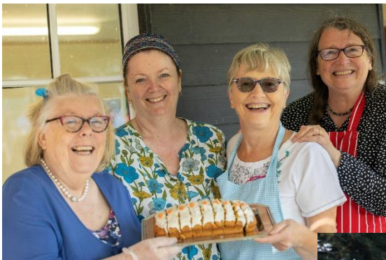
...and there were lots of happy, smiley people.