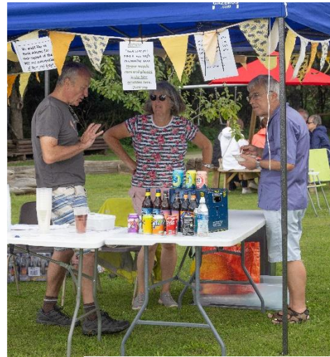
The beer didn't run out...