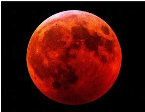
Totally Eclipsed Moon (Blood Moon)

Artificial Satellites. Plenty of these to see, just stand out for 30 mins or so and you should be able to spot several moving across the sky. They usually move from the West to the East, but there are also several that move South to North. Some satellites move in small groups or in a line, so always fun to watch out for these.